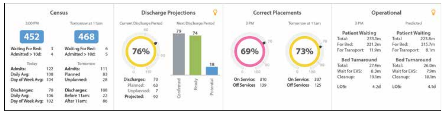
FutureFlow Rx<sup>™</sup> Dashboard

patient flow and reduce length of stay. As a web-based application with specific functionality available for defined roles and rights, healthcare organizations can realize 30% increases in patient throughput with no impact on cost or quality of care.